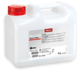
Capacity: 5 L

The complexing agent (descaler) prevents the formation of limescale especially on the heating elements and chamber which if not treated can lead to longer cycles, and heightened utility cost. The use of the ProCare Med 10 BPD prolongs the service life of the machine and loads, as it can reduce discoloration of plastic bedpans and urine bottles.