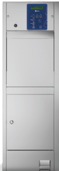
BP 100 HSER