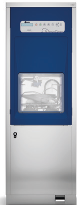
BP 100 HLA