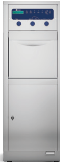
BP 100 H