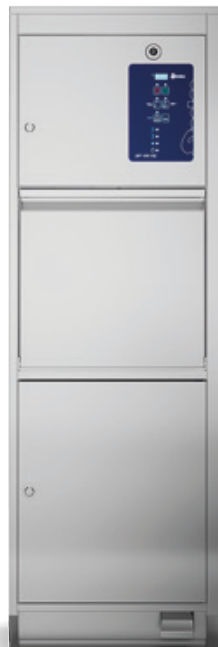
BP 100 HE