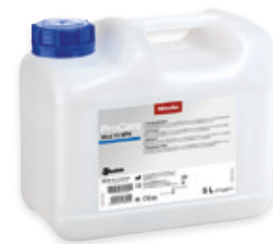
Capacity: 5 L

Alkaline detergent to provide excellent cleaning results, used in bedpan washers for the cleaning of bedpans and urine bottles.