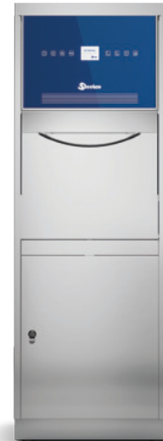
BP 100 HXL